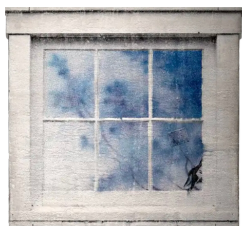
Chloe Abidi untitled (window) 2024 Dye sublimated wood board 23" x 25" $775