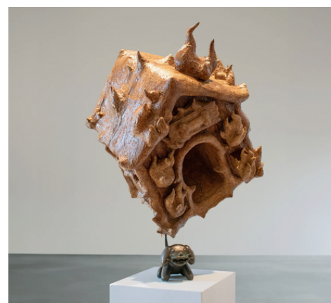
Soo Park DOG HOUSE FIRE HOUSE DOG 2024 Bronze Casted Metal, Plastic, Wood Stain, 3Doodler 24" x 20" x 32"