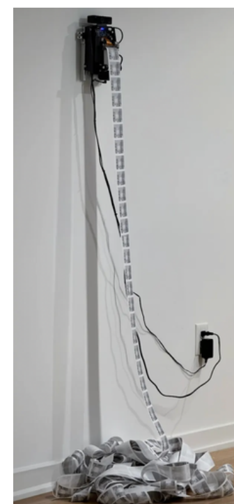
Yichen Ji myReplica.txt 2024 Mixed media 5.9" x (7.7" or 55.5' variable dimensions) x 4.3"