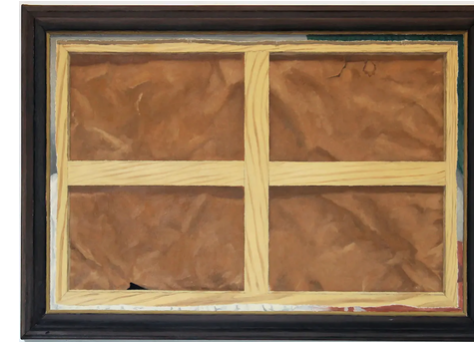
Walker Keith Jernigan Nude Revealed 2020 Oil on canvas 34" x 48" $ 850