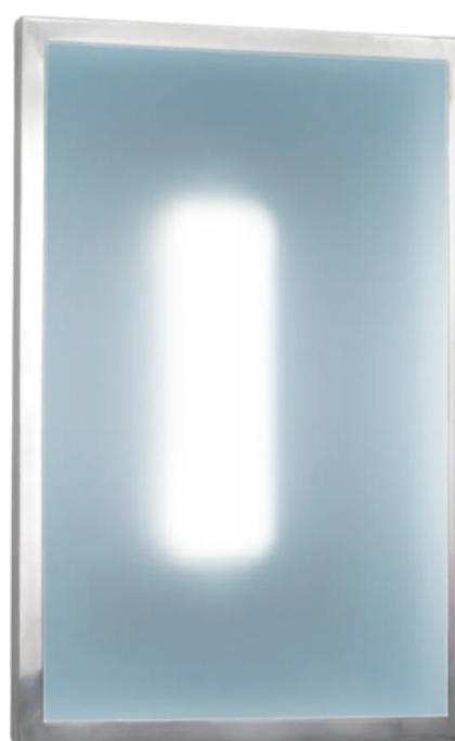
Rene Gortat Follow The Light 2016 LEDs, Plexi, Metal 24" x 18" x 1.5"