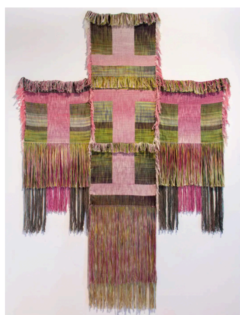
Xiao Guo Passage 1 2024 Hand-dyed Cotton 45" x 60"