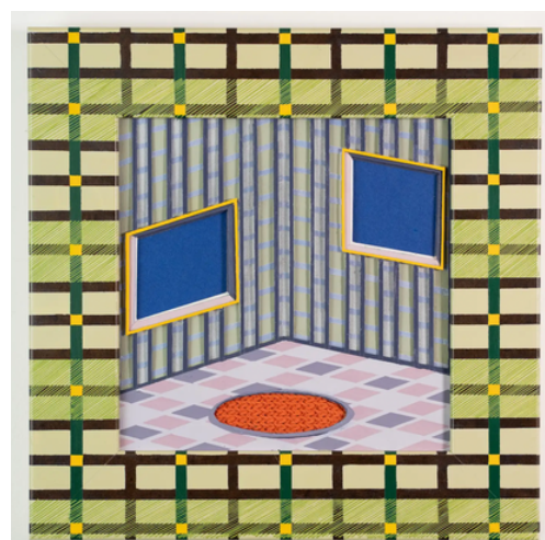
Kailey Coppens Location, Location, Location 2024 Glass, Particle Board, Acrylic Paint, Linen and Paper 11.5" x 1" x 11.5" $2,500