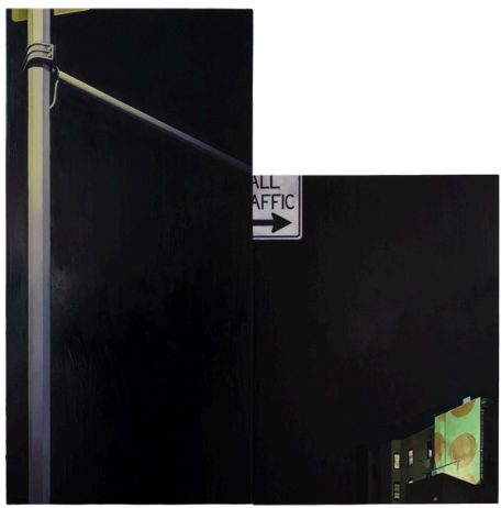
Ruoxi Hua Homesick Alien , 2024 Oil on jointed panel 24" x 24" $1,300