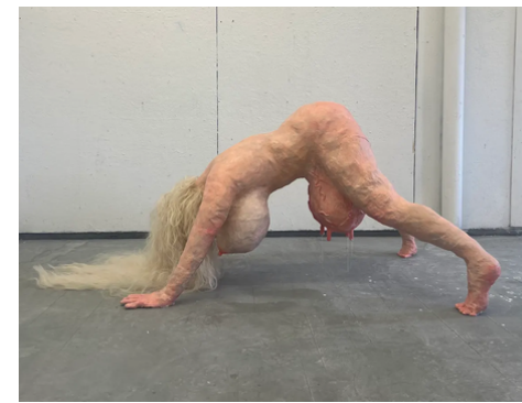
Chloë Walker Mommy Milker #2 2024 Paper; duct tape; metal; wood; plaster; acrylic paint; epoxy resin; Epoxy Sculpt; synthetic hair and lashes, glass eyes 34"x 42"x 54"